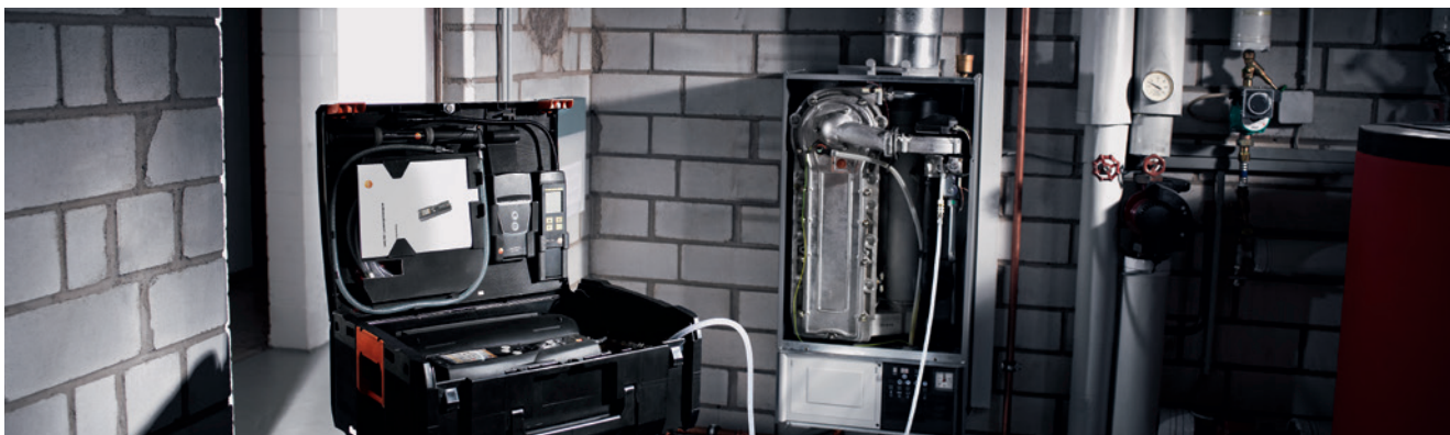
Automatic servicability test with gas-feed appliance with connection to the gas boiler