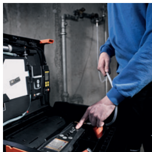
Automatic tightness test