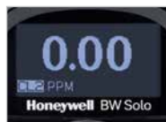
Easy to read