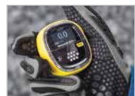
Easy to handle