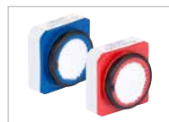
Easy to service