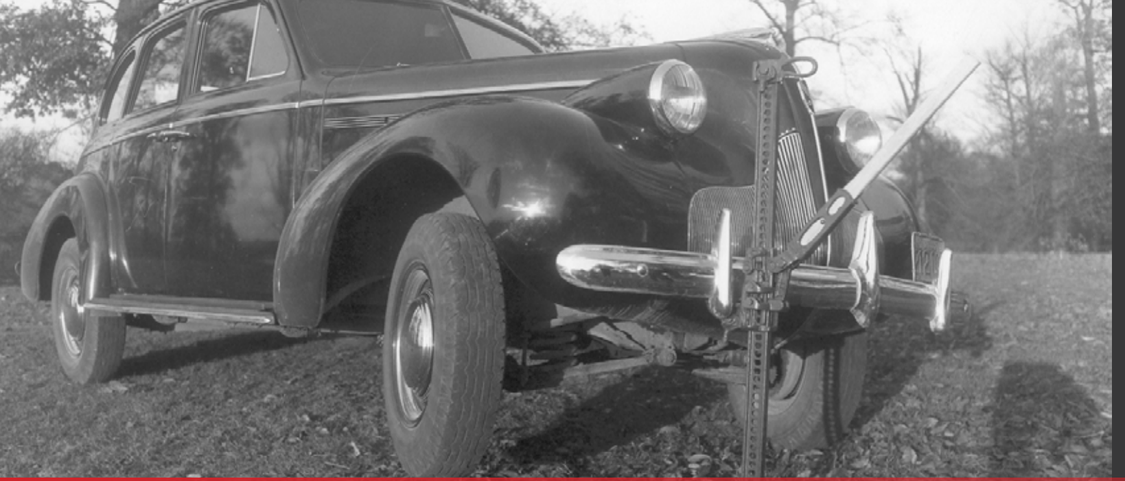
We believe in providing the highest quality products possible, and standing behind them.