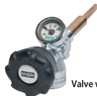
Valve with Gauge