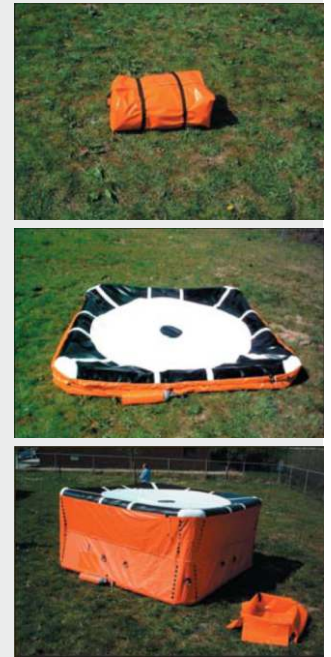
Easy & Quick setup